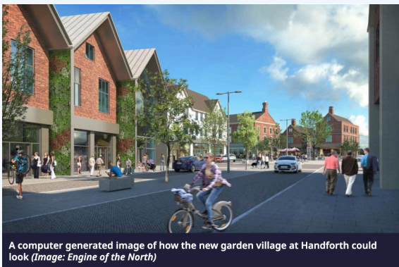
A computer generated image of how the new garden village at Handforth could look

In February 2023 the Economy and Growth Committee met to discuss their ambitious plans to develop a "new sustainable settlement with approx. 1,500 new dwellings (of which 30% will be affordable homes), a new village centre and high street, a through school, sports facilities, and sustainable transport routes"